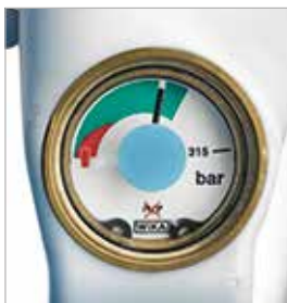
Permanent pressure gauge