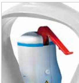
On / off lever