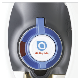
On/off hand wheel