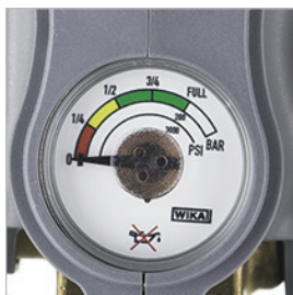
Permanent content gauge