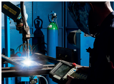
Robotic MAG welding

The high-performance gas shielding solution for high-speed MAG welding of carbon steel