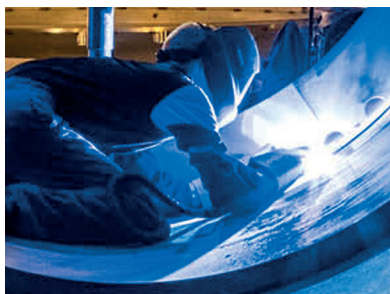
TIG welding of stainless steel