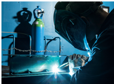
MIG welding of aluminium

The high-performance gas shielding solution for TIG and MIG welding of all materials