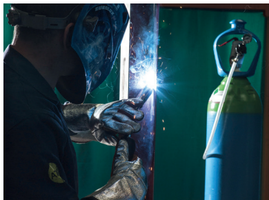
MAG welding of carbon steel

The high-performance gas shielding solution for high-speed MAG welding of carbon steel