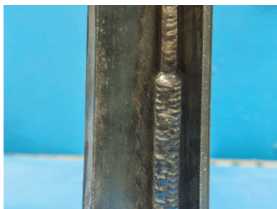
Multi pass welding - vertical up

ARCAL™ Force is available in several supply modes ensuring quality, consistency and ease of use.