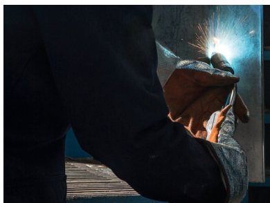
All position welding