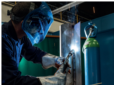
MAG welding of stainless steel

The high-performance gas shielding solution for all stainless steel MAG applications